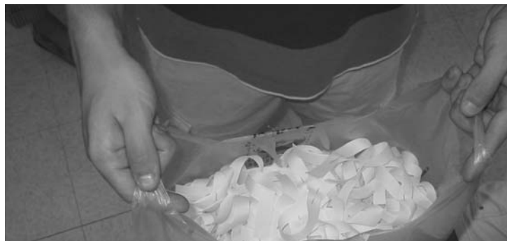
A Jenkins High School Key Club member holds a bag of 500 white ribbons the students assembled.