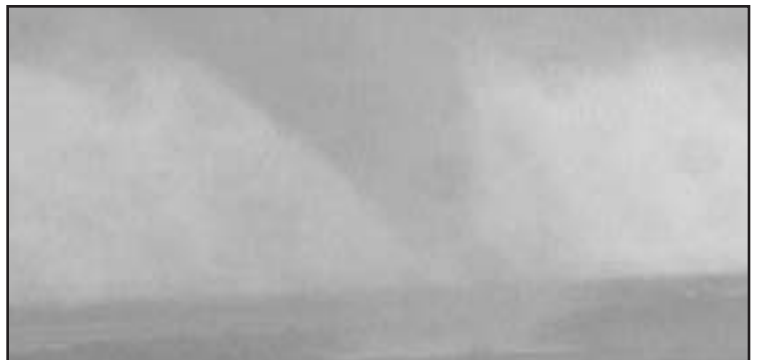
WTOC-TV's Skycam captures the tornado at Old Fort Jackson

Several fort employees and tourists were standing outside when they saw the twister come roaring through the woods. The group took cover in the buildings near the entrance to the property. The twister tore roofing shingles off a garage shed, blew out window glass in the same building, and blew down