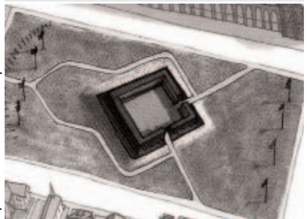
(above) An artist’s conception of the Spring Hill Redoubt at Battlefield Park.