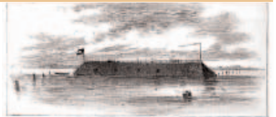
(above) A historical newspaper drawing of the Georgia . (below) A sonar image of the wreck taken in summer 2003.