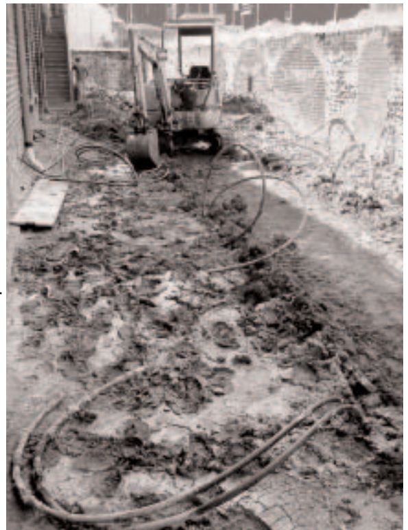
(above) Coils of pipe snake up out of the mud as contractors install a geothermal heating and cooling system beside the Tender Frame Shop at the Roundhouse Railroad Museum.

Engineers are tapping the natural heating and cooling power of the earth to regulate the temperature in one building at the Roundhouse Railroad Museum. Recently, crews installed a geothermal system at the Tender Frame Shop. This hi-tech, environmentally friendly device sends water through coils two hundred feet beneath the surrounding soil. The water will take summertime heat from inside the building and disperse it belowground; alternately, in the winter, the water will bring heat from the earth into the structure. The constant 70-degree temperature of the soil heats and cools much more efficiently than the outside air. Before the digging started, staff archaeologists verified that no significant artifacts would be disturbed. In late June, the grassy area beside the Tender Frame Shop was a muddy mess. But project manager Billie Graham of the Preservation Team said, "In another week, the site will be covered over and ready for new grass. Once the grass grows back, you won't notice that anything's there with the exception of a single pipe running into the building."