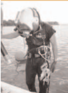
(above) A diver prepares to dive on the CSS Georgia wreck site in summer 2003.