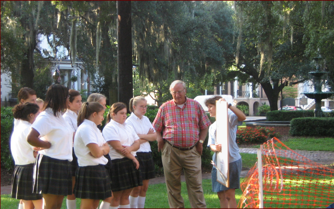
Top: Students from St. Vincent's Academy see history uncovered right before their eyes in Lafayette Square, for a better understanding of Savannah's role in the American Revolution.

We would like to thank everyone who supported the project, including the enthusiastic tourists and citizens of Savannah who visited the site and were as excited about this project as we are.