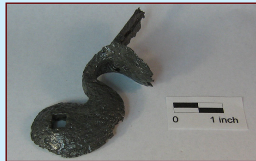
Top: Gun cock from a British Brown Bess musket that archaeologists uncovered in the ditch the British dug in 1779.